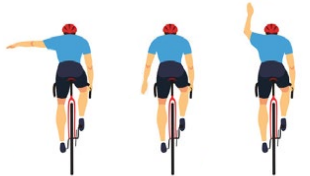
LEFT TURN STOP RIGHT TURN