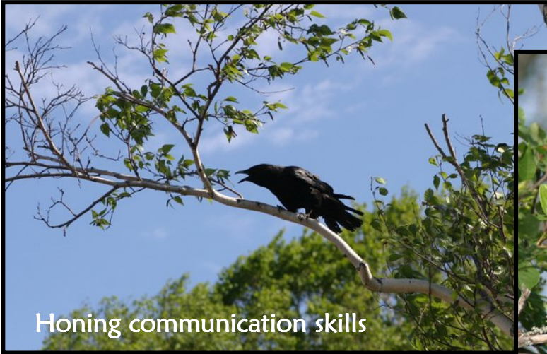
Honing communication skills