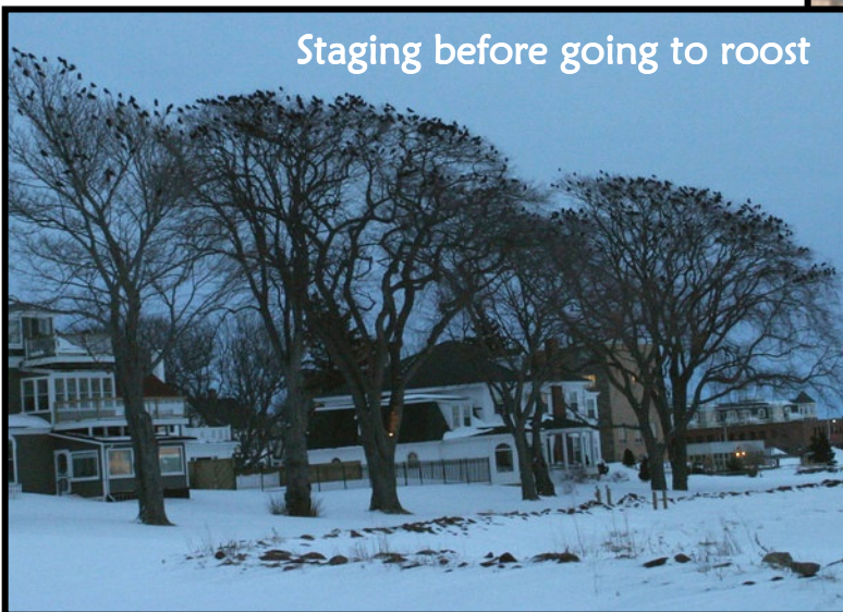
Staging before going to roost