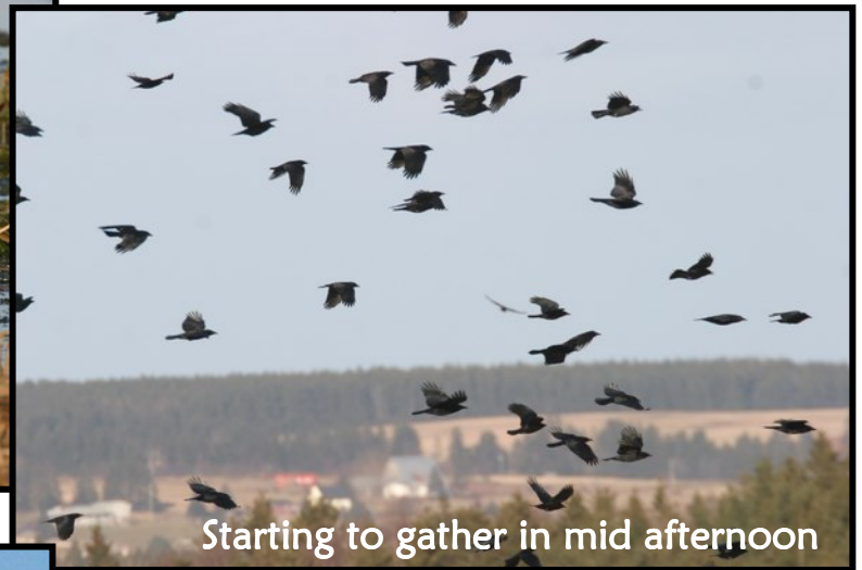
Starting to gather in mid afternoon